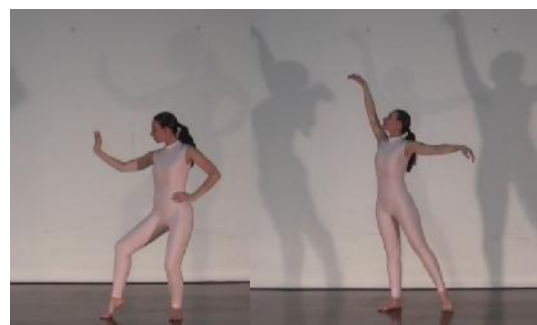
Fig.2 Gentle, delicate, soft movement

Gentle, delicate, soft movement (symbolic of effortlessness and respect for the body);