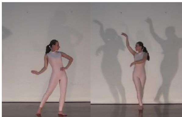
Fig.5 Wavelike lines

Wavelike lines (symbolizing adaptation to change and the movement both of water and air);