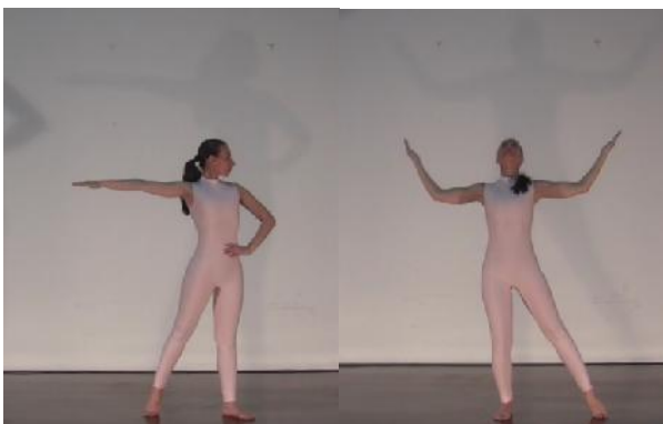
Fig.4 Straight lines

Straight lines (symbolizing the focus, attention, awareness, strength, balance and the confidence of the being);