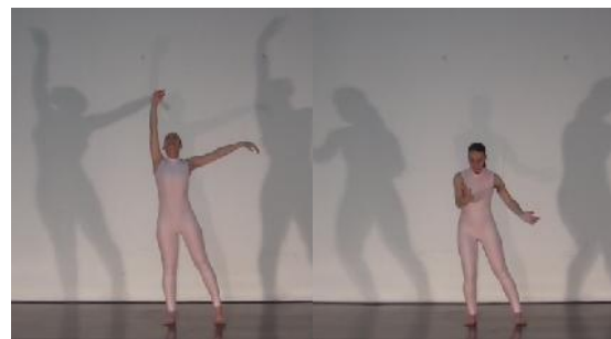
Fig.1 Movement synchronization with breathing

2.3 Key features. Movement synchronization with breathing (in Yoga, the conscious breathing is a fundamental element and the movement of Extemporaneous Dance is based on the coordination of movements with breathing. Thus, in general, upward movements are made inhaling and the downward movements, exhaling);