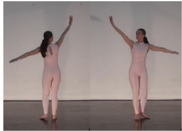
Fig.6 Rotations and Translations

Rotations and Translations (symbolizing the movements of rotation and translation of the Earth)